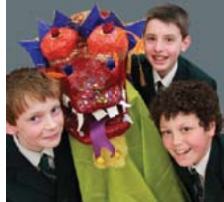
St Annes Art Show P12