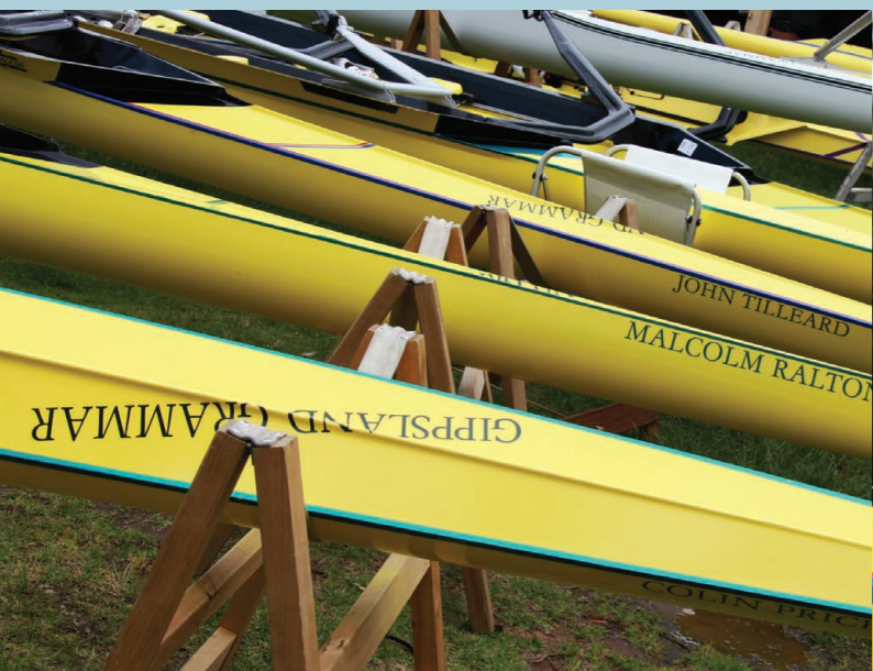
The newest addition to the School's rowing fleet.