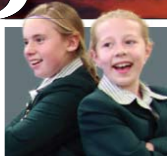
Bairnsdale Celebrates P3