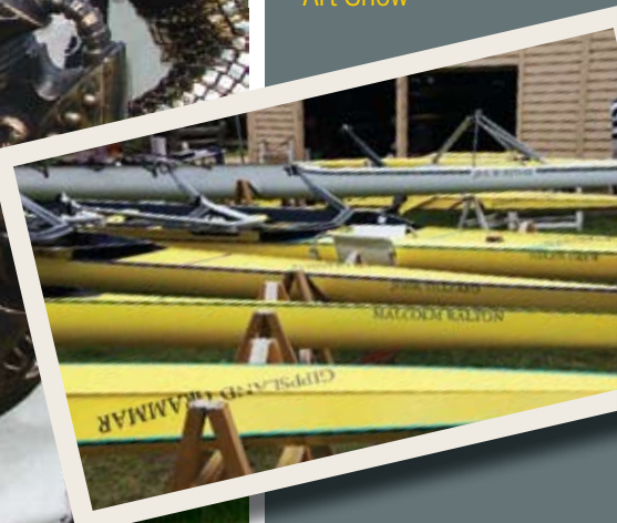
Stalwarts Honoured P6